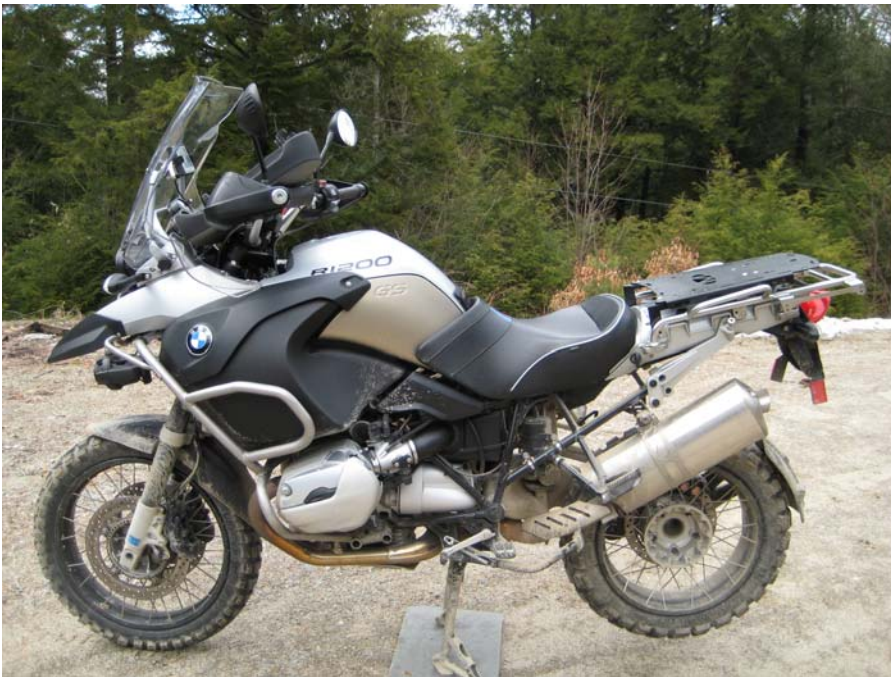
Pack Rack installation is completed. Load up your gear and go!